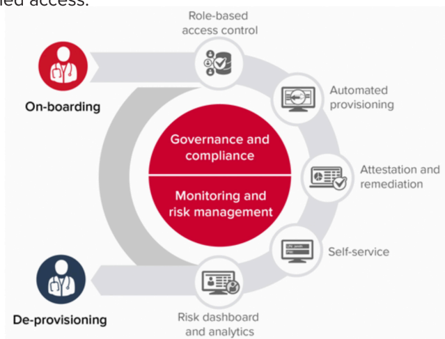
Imprivata Identity Governance

Imprivata Identity Governance provides fast, secure, role-based access to IT systems and applications. Designed and built exclusively for healthcare, the solution automates identity and risk management processes, enables compliance with internal and regulatory guidelines, and allows clinicians to focus on quality patient care on day one. When combined with Imprivata OneSign and Imprivata Confirm ID, the solution provides a holistic view of access risk vulnerabilities, including excessive or abnormal access rights and un-provisioned access.